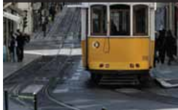
Tram in Lisbon

Legend has it that Lisbon was founded by Ulysses. The name comes from “Olissipo”, which has its origins in the Phoenician words “Allis Ubbo”, meaning “enchanted port”.